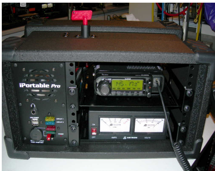
Ocean County ARES Go-Kit

According to Pete, K2PSG, the state has approved 966 nuclear funding of several D-Star Go-Kits, which include Icom 880H transceivers, power supplies, custom iPortable cases, Low Loss PowerGate power distribution including backup battery, Kantronics TNC and Signalink, which will enable the Go-Kits to connect via D-Star or FM with Voice, Winlink or NBEMS. The Go-Kits are to be assembled by Ocean County ARES members as part of a workshop. Details will be discussed at the December meeting, as mentioned above. The finished Go-Kits should look something like the unit pictured below: