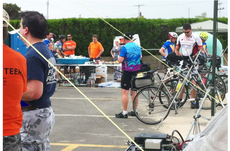
Lavallette Rest Stop for 2015 MS-170 Bicycle Tour

May 16th and 17th saw the MS-170 bicycle tour come through our area and many local hams assisted with communications. Amateur Radio always plays the role of providing a communications link between cyclists on the route and MS Tour Directors. Most decisions are made at the last moment and depend on Amateur Radio to get the word out to participants whether they be a rider or a rest stop volunteer. KUDOS to those operators who participated!