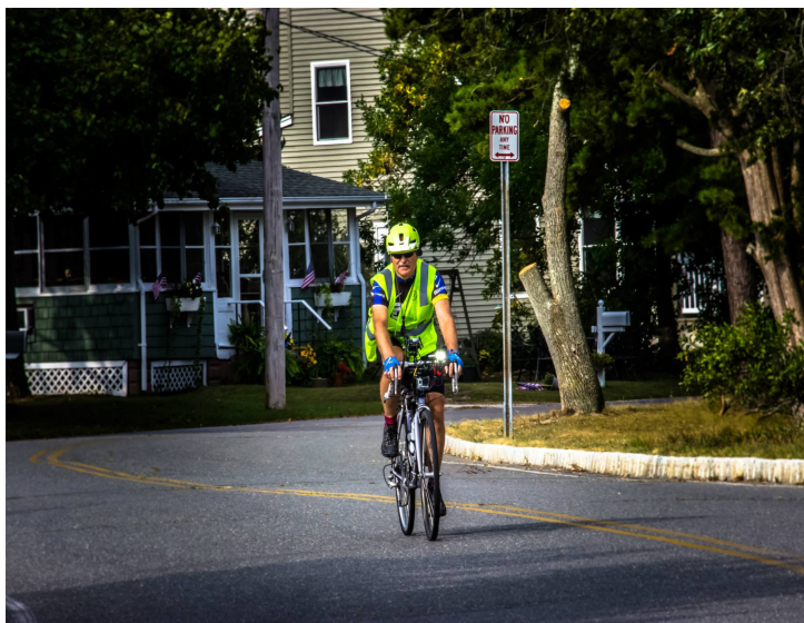
2015 B2B 32 Mile Sweep, WX2NJ Bicycle Mobile

Amateur Radio really impressed the event organizers!