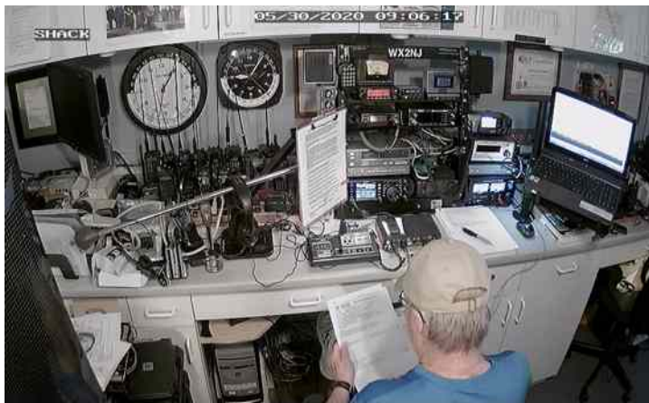
WX2NJ transferring Red Cross messages to SNJ SEC, WB2ALJ

Once WB2ALJ had the messages, they were sent to a central Red Cross agent by NJ2N and KB2RUV via ARDOP Winlink on HF. No Internet was used during the entire transfer process, which was one goal of the exercise.