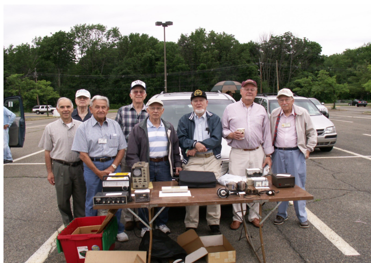
The whole Group